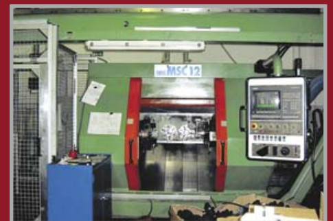
Zunanji izgled stroja EMAG MSC 12 Outside look of the two-spindle lathe EMAG MSC 12