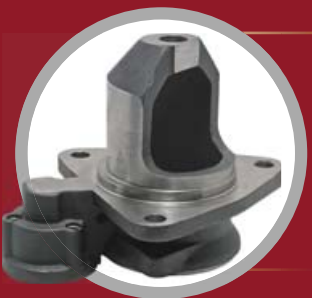
Ohišje reduktorskega zaganjalnika Reducer starter housing