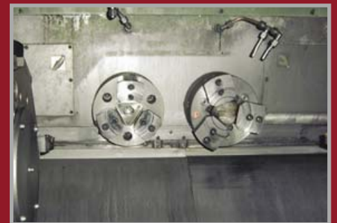
EMAG MSC 12 z gnanimi orodji Two-spindle lathe EMAG MSC 12 with driven tools