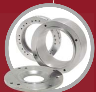
Balansirni obroč AC/DC motorja, prirbnice AC/DC motorjev Balancing ring for AC/DC motor, flanges of AC/DC motors